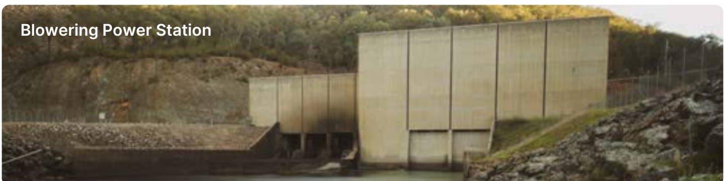
Blowering Power Station

Water releases from Blowering Dam are controlled by the NSW State Government to provide for downstream town water supply, irrigation and environmental uses.